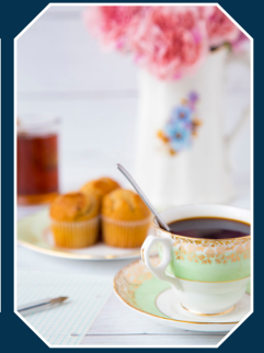
At Mugs & Muffins, ladies gathered for a wonderful morning of fellowship and encouragement while learning about ministry opportunities. (Article on next page)