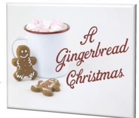
Table designers can sign up on the Women's Ministries bulletin board in the Welcome Center. As a thank you, table designers will be able to purchase tickets ($10 each) at their tables prior to the start of general sales on November 5.

recruiting table designers who are willing to bring their creative touches to our tables. Never designed a table before? No problem! We have ladies who are willing to come alongside and walk you through the process, even providing dishes and décor, if needed.