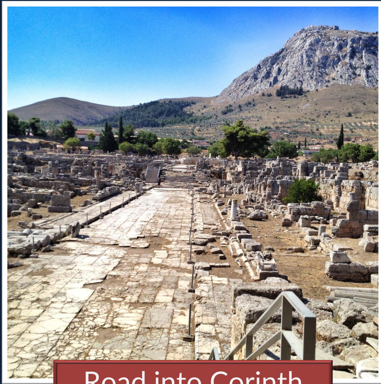
Road into Corinth