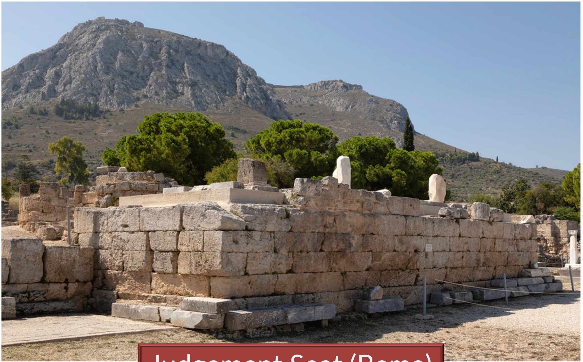
Judgement Seat (Bema)