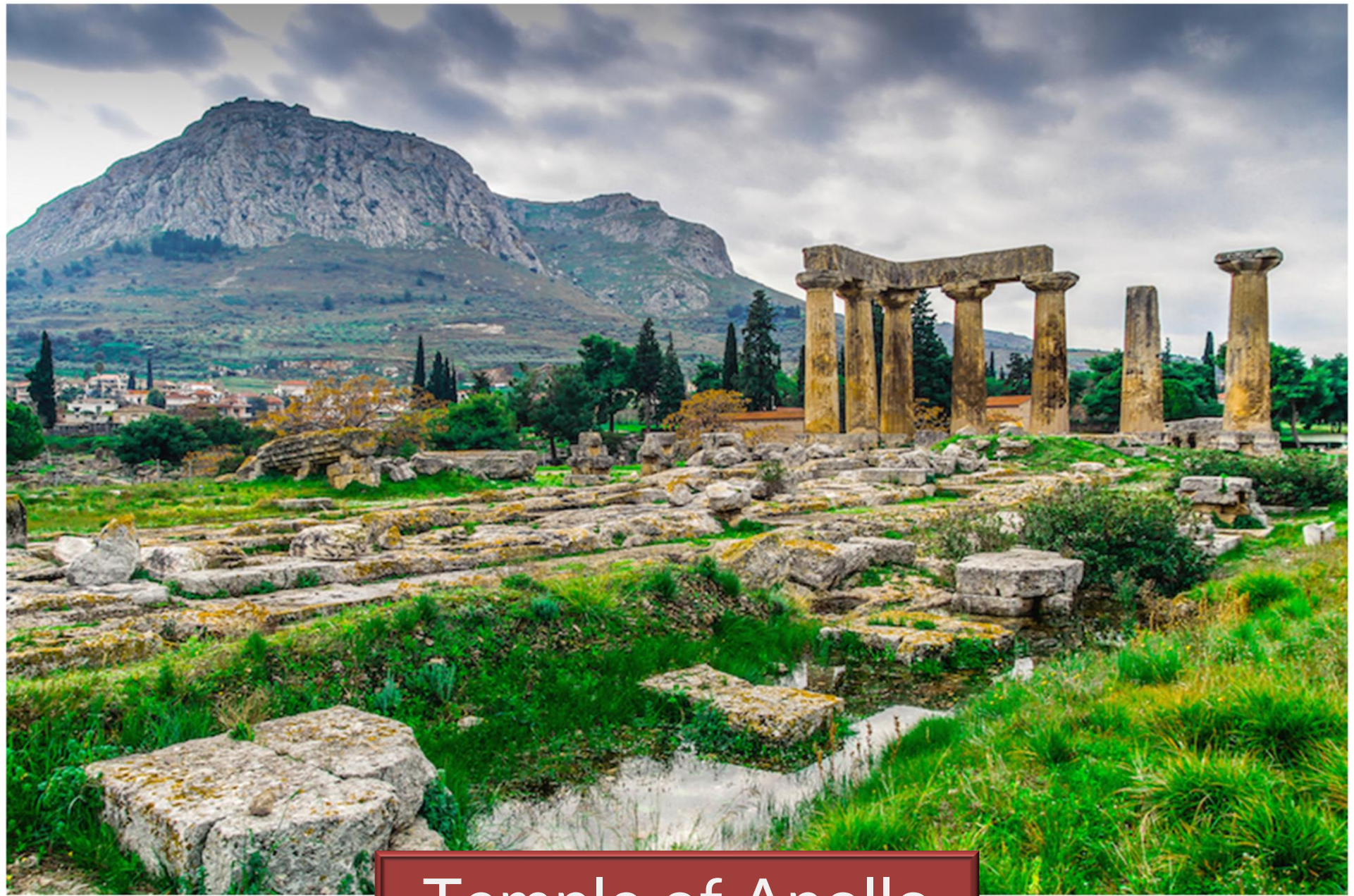
Temple of Apollo