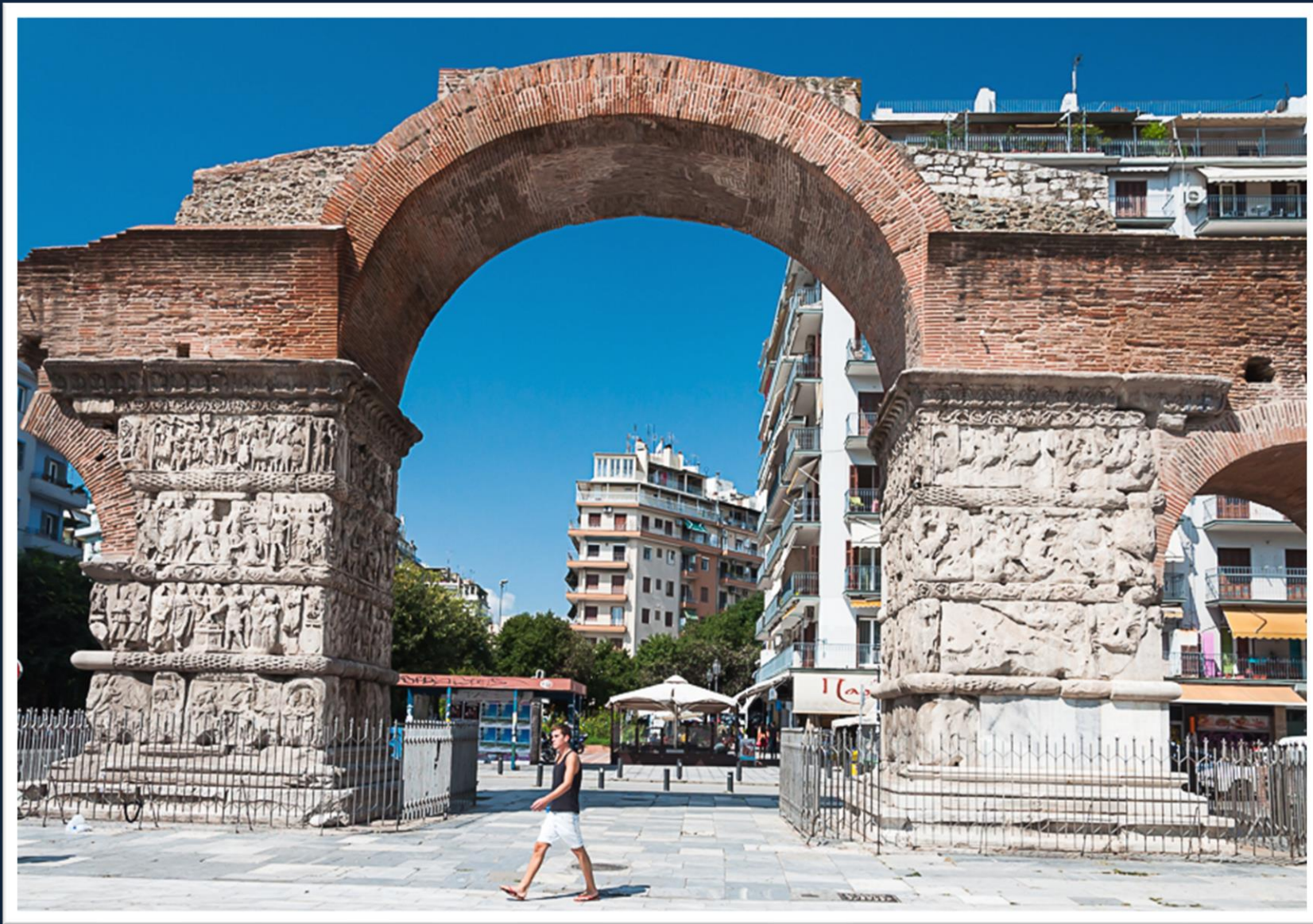
Arch of Galerius