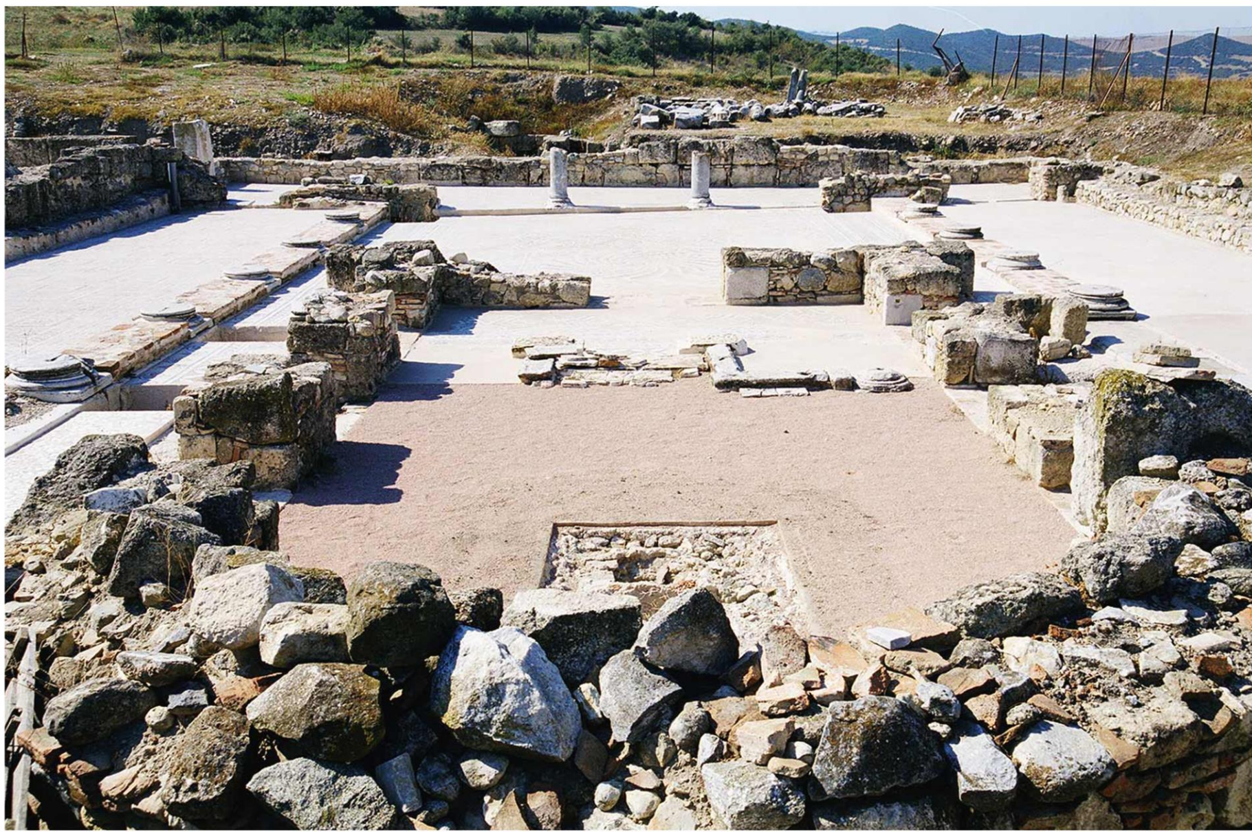
Ruins in Amphipolis