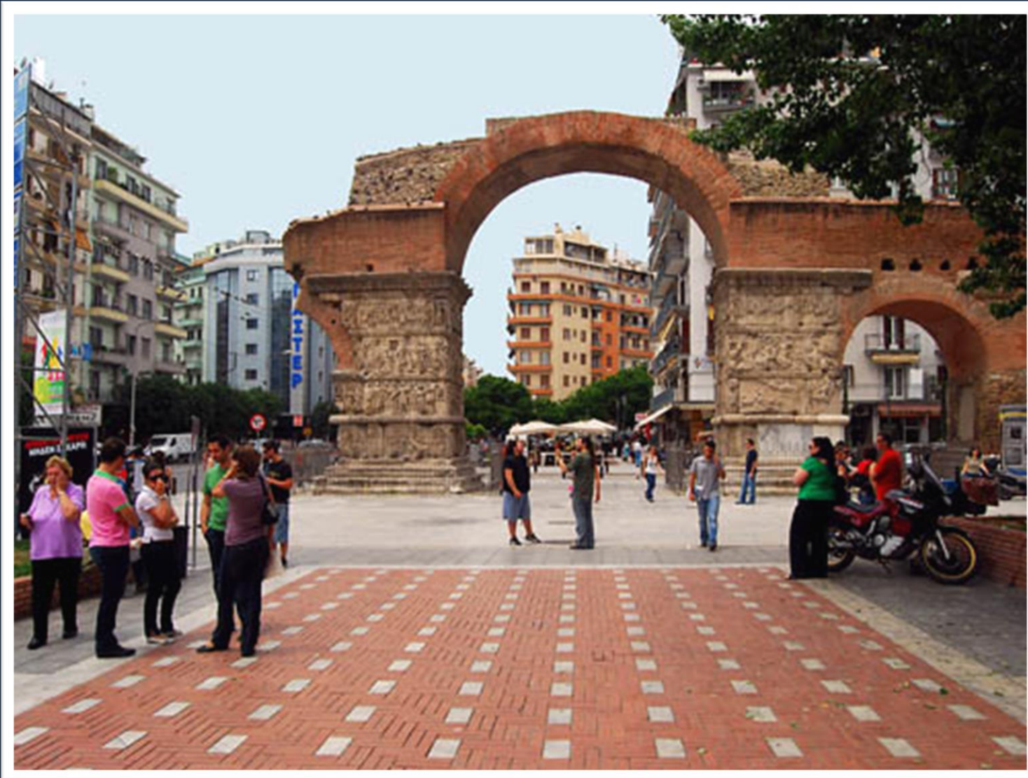
Egnatian Way in Thessalonica