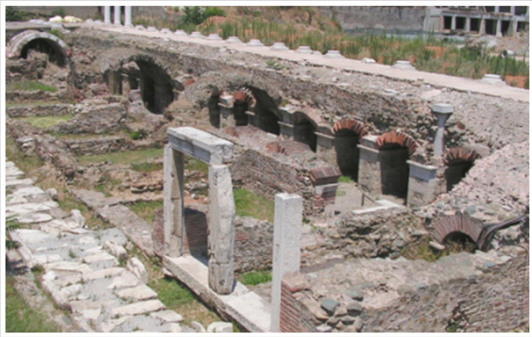
Ancient Thessalonica marketplace