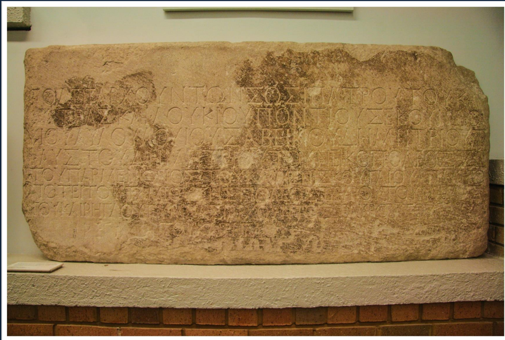
Thessalonian politarches inscription