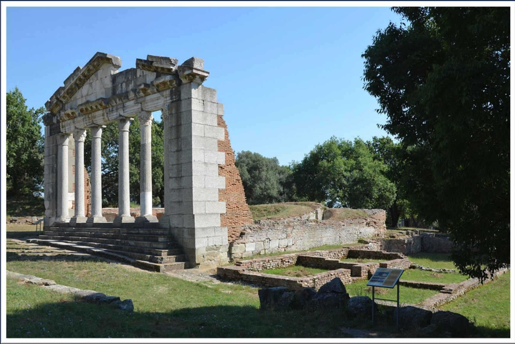
Ruins in Apollonia