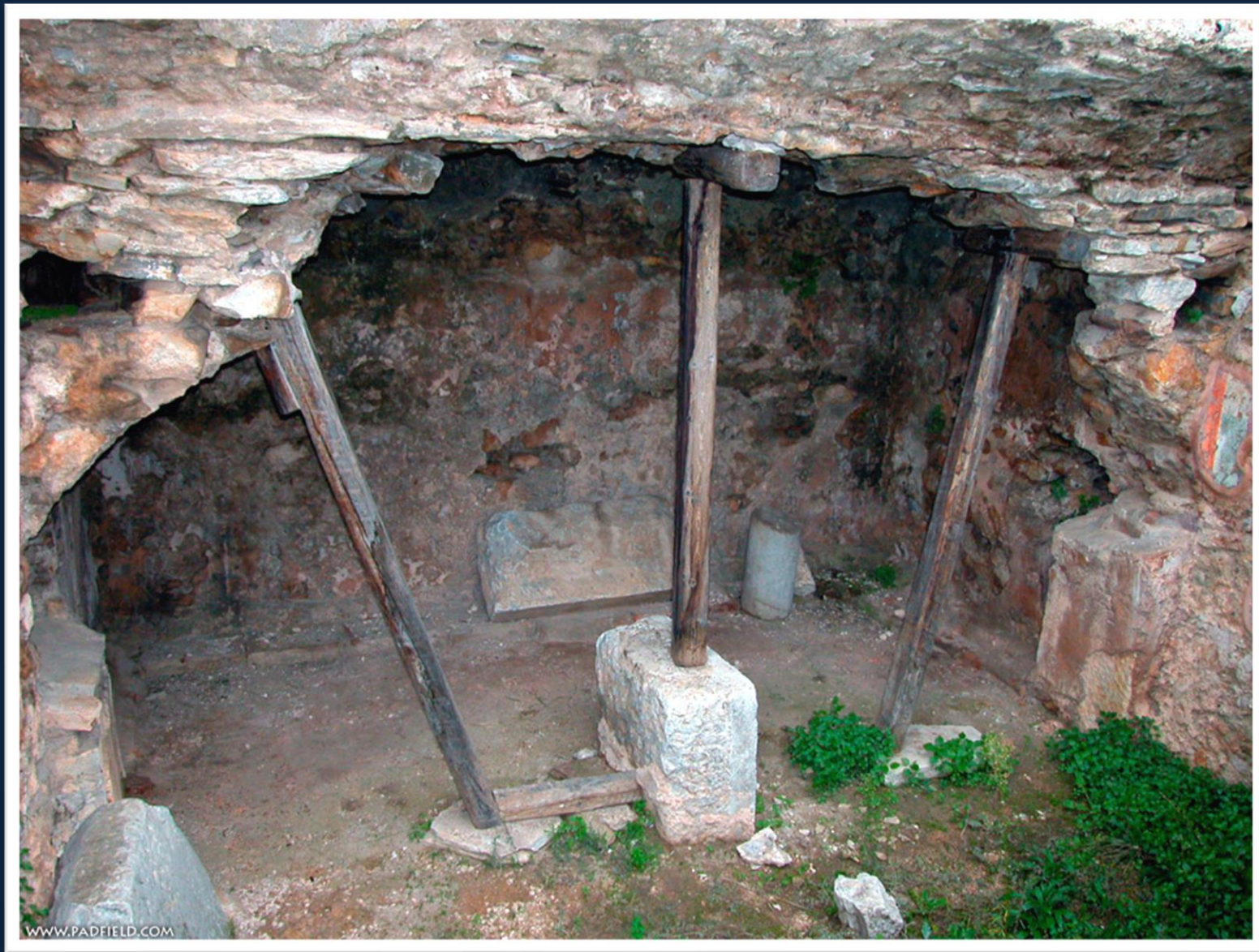
Prison cell in Philippi