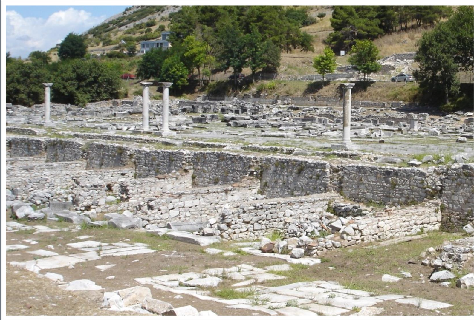
Shops lining the Agora in Philippi