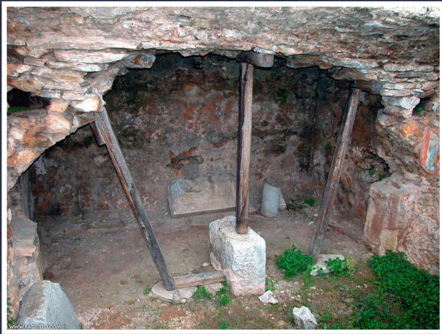
Prison cell in Philippi