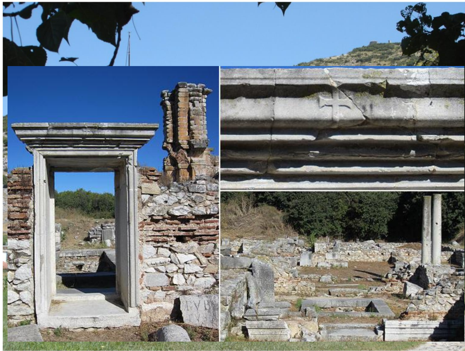
Basilica ruins in Philippi