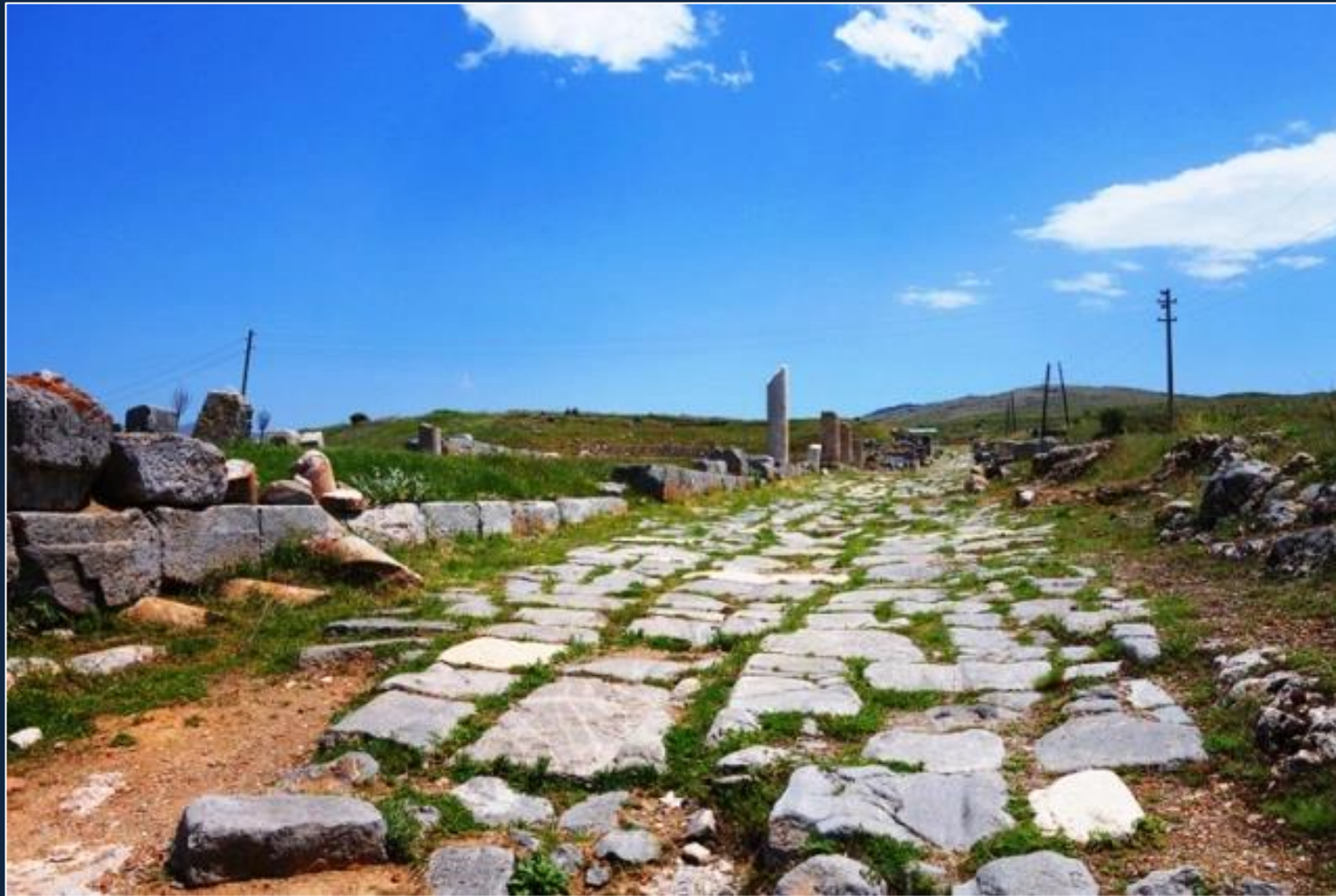
Decamanus Maximus which was one of the major streets through Antioch of Pisidia