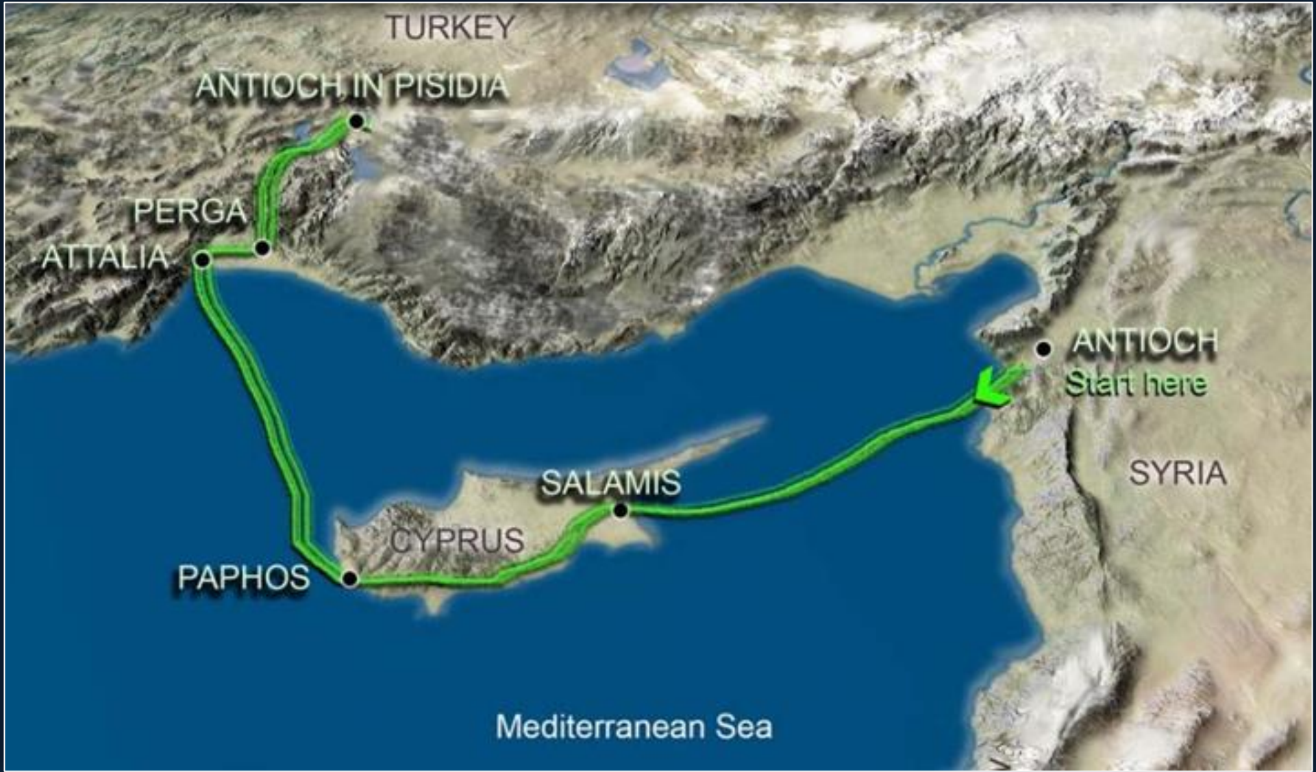
Antioch Syria to Antioch Pisidia