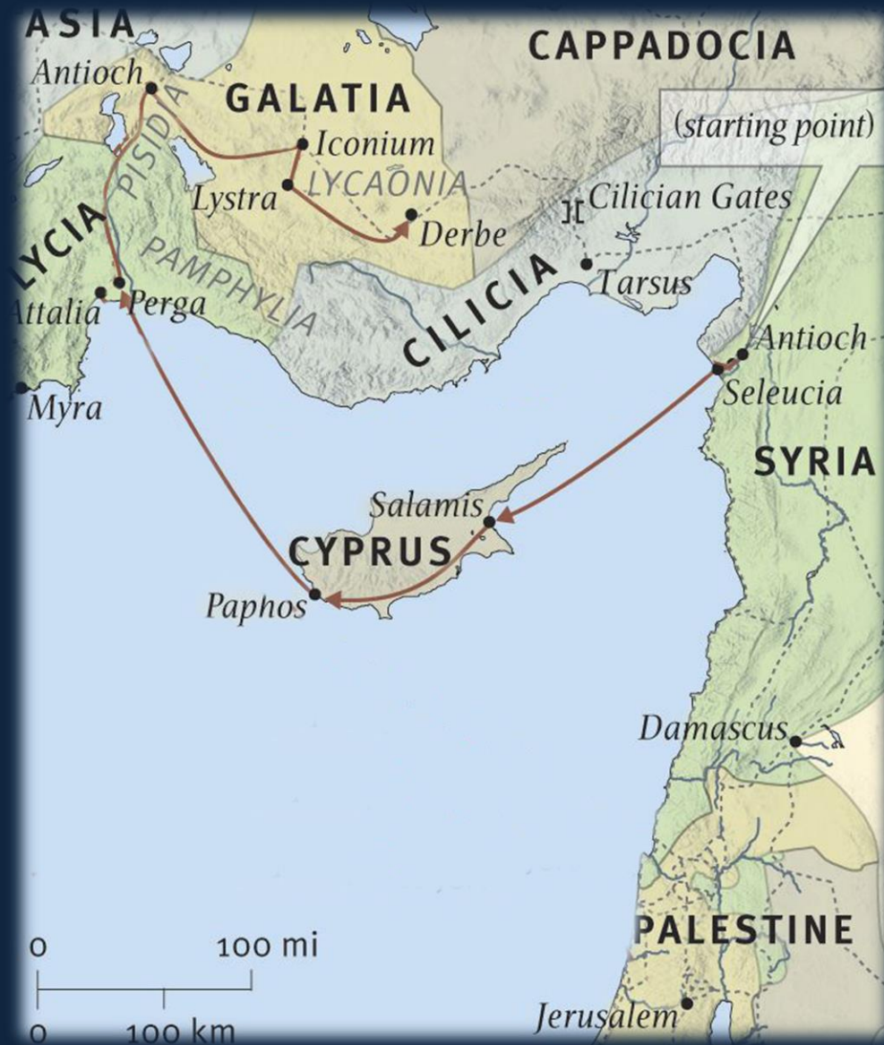
Paul's First Missionary Journey