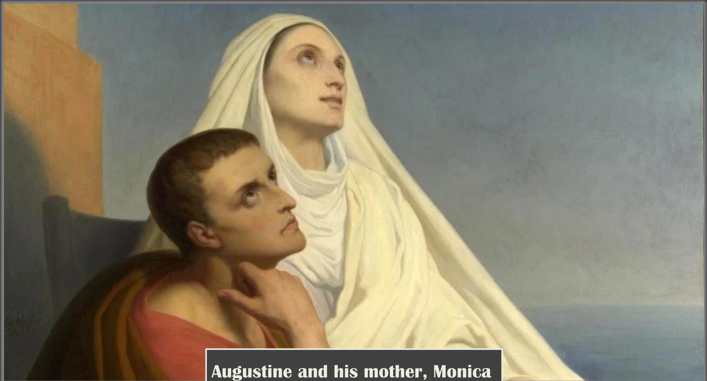
Augustine and his mother, Monica