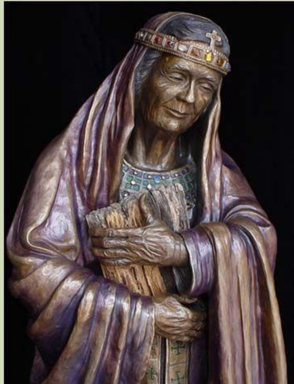
Constantine's mother, Helena