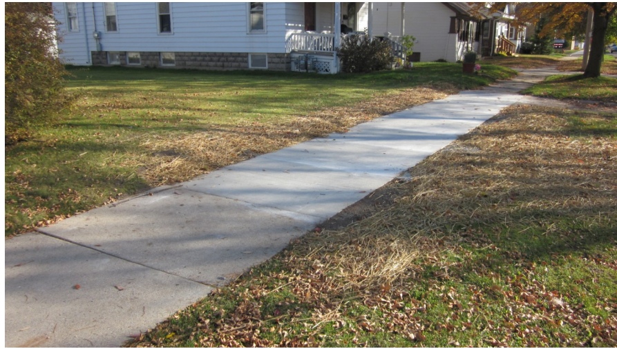
Sidewalk on 16th Street