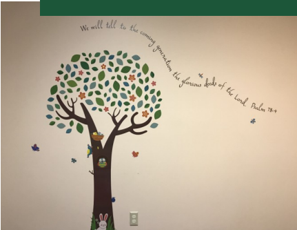
Babies & Toddlers

Check out some of the new Children's Ministries décor . . . It's sure to encourage little and big hearts alike!