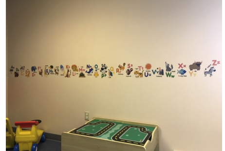
2's & 3's