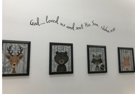
4's & 5's